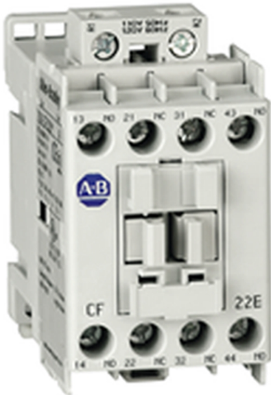
Representative Photo Only (actual product may vary based on configuration selections)